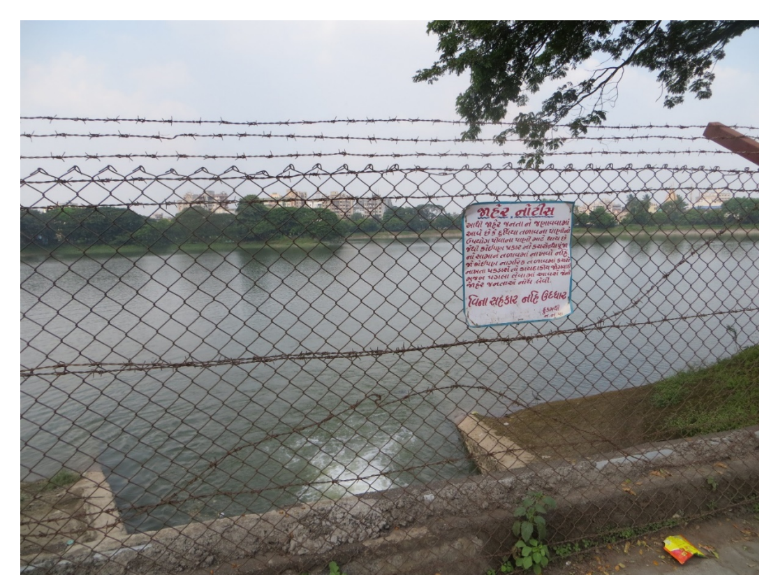
Figure 2. Enclosure of Dudhiya Talav.

At first glance, the case of Dudhiya Talav seems to constitute a typical example of enclosure, state-led dismantling of an urban commons, social exclusion, and marginalisation. Materially fencing off the pond area represents "the most rudimentary and geographically obvious form of enclosure" (Jeffrey et al., 2012: 1250), the more so as slum dwellers were relocated to make way for two small parks and a beautified tree-lined embankment.<sup>5</sup> The pond itself has become off-limits to residents (Figure 2); as one middle class resident explained, "It is [a] no entry area now, so there is a law that I cannot go". The pond also lost its socio-ecological functions of recharging groundwater and of providing an important social and spiritual space in the city. Apart from the slum dwellers, the enclosure affected two communities in particular: professional laundry workers and fishers.