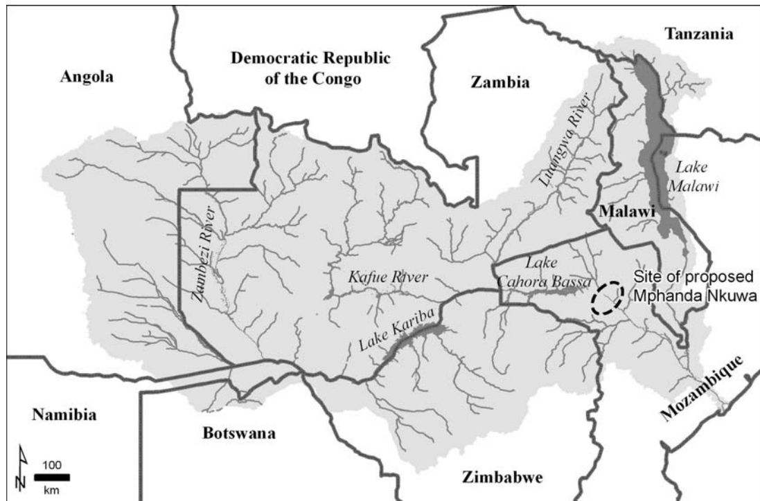
Figure 2. Zambezi river basin showing locations discussed in text.

Critics of the development trajectories sketched above, citing the dubious legacies of past efforts to undertake large-scale river alteration via damming and other infrastructural development (see WCD, 2000; McCully, 2001) argue that current plans for rapid basin transformation will entail a host of deleterious socio-ecological consequences: massive displacements and resettlement programmes for the thousands of people in each basin whose communities correspond to future reservoirs; permanent disruption of natural flow regimes that sustain, particularly in the case of the Mekong, productive fisheries and the communities who depend on them; 16 a cascade of ecological impacts including disruption of, in the Zambezi, a globally recognised wetland ecosystem in the deltaic region and an economically important estuarine fishery; and long-term, unpredictable effects on the rivers' eco-hydrological characteristics that stand to increase human vulnerabilities and test ecosystem resilience in innumerable ways. Social movements in the Mekong and Zambezi that are contesting state designs on the basin's resources are perhaps best characterised as networks (or coalitions) that operate locally, nationally and transnationally. These networks are composed of community-based organisations (particularly in the Mekong), local and national NGOs of specific countries, international advocacy