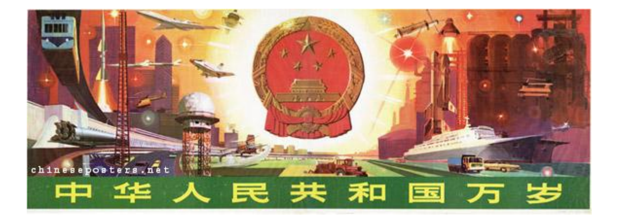
Figure 3. 'Long Live the People's Republic of China' (Zhonghua renmin gongheguo wansui), 1979.

Source: Stefan R. Landsberger Collection, International Institute of Social History (Amsterdam), (Designed by Gao Quan and Yang Keshan; Published by Renmin Meishu Chubanshe).