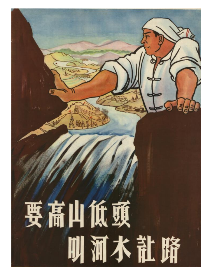
Figure 2. 'Make the high mountains submit and the rivers give way' (1958).

Note: "Every kind of difficulty has to give way before Communists, just as in the saying 'Mountains bow their heads and rivers give way" [Mao Zedong Speech at the National Conference of the Communist Party of China, March 1955, reprinted in Mao (1977: 157)].