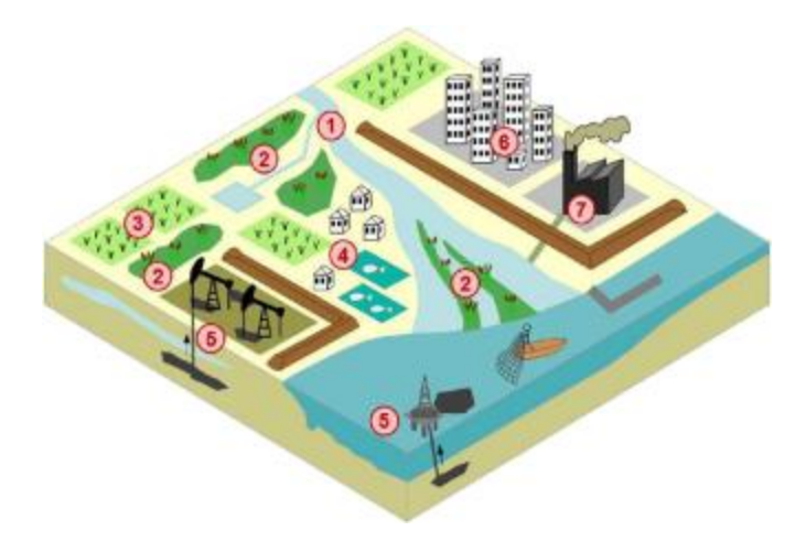
Legend: (1) River canalisation; (2) wetland ecosystem threatened by anthropogenic processes; (3) water diversion for irrigation; (4) aquacultural-related ground water pumping and subsidence; (5) oil pumping, spillage, and subsidence; (6) urban agglomeration, (7) industries causing pollution and subsidence (Kuenzer et al., 2014).