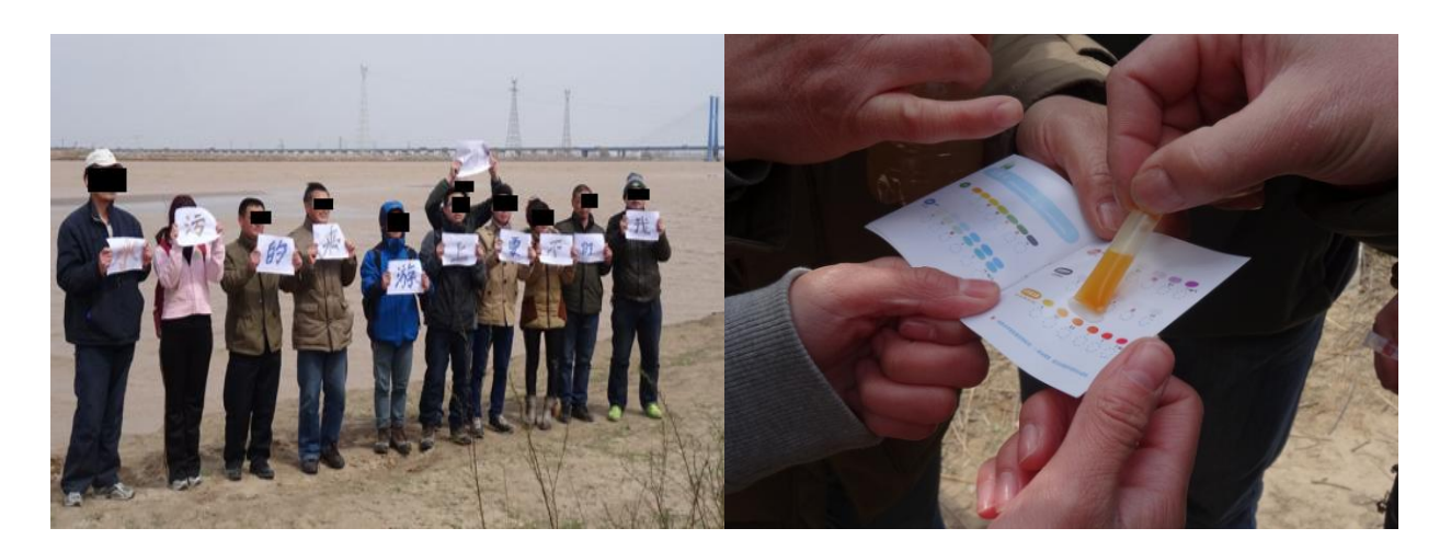
Figure 4. Environmental campaigns (left)<sup>18</sup> and water quality tests (right) in Dongying