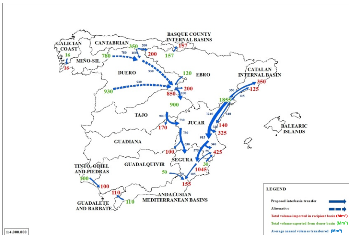
Figure 2. The Spanish National Water Balance Integrated System (SIEHNA) proposed in the 1994 draft of the National Hydrological Plan (NHP).

In Spain, River Basin Authorities (RBAs) and basin-scale water planning, whose purpose was the augmentation of supply, had been in place since the early 20th century. The 1985 Water Law replaced the 1879 law and adapted water legislation to the new administrative and political democratic regime that had taken over in 1975. It incorporated the protection of chemical water quality and sustainability concerns as policy goals but maintained the basic premises of the hydraulic paradigm. This approach culminated in 1994 with the Sistema Integrado de Equilibrio Hidrológico Nacional (SIEHNA, the Spanish National Water Balance Integrated System), an ambitious grid of interbasin water transfers that was part of a proposed National Hydrological Plan (NHP) (Hernández-Mora et al., 2014). The proposed NHP was significantly contested, publicly and politically and acted as a catalyst for the consolidation of the NWC movement (Font and Subirats, 2010). Figure 2, which is based on official maps and documents of the time, shows the proposed grid of interbasin water transfers. It illustrates the lack of consideration of the transboundary nature of many Iberian river basins, with Portugal not even shown on the map. This is characteristic of water management approaches under the hydraulic paradigm that was in place before the approval of the WFD.