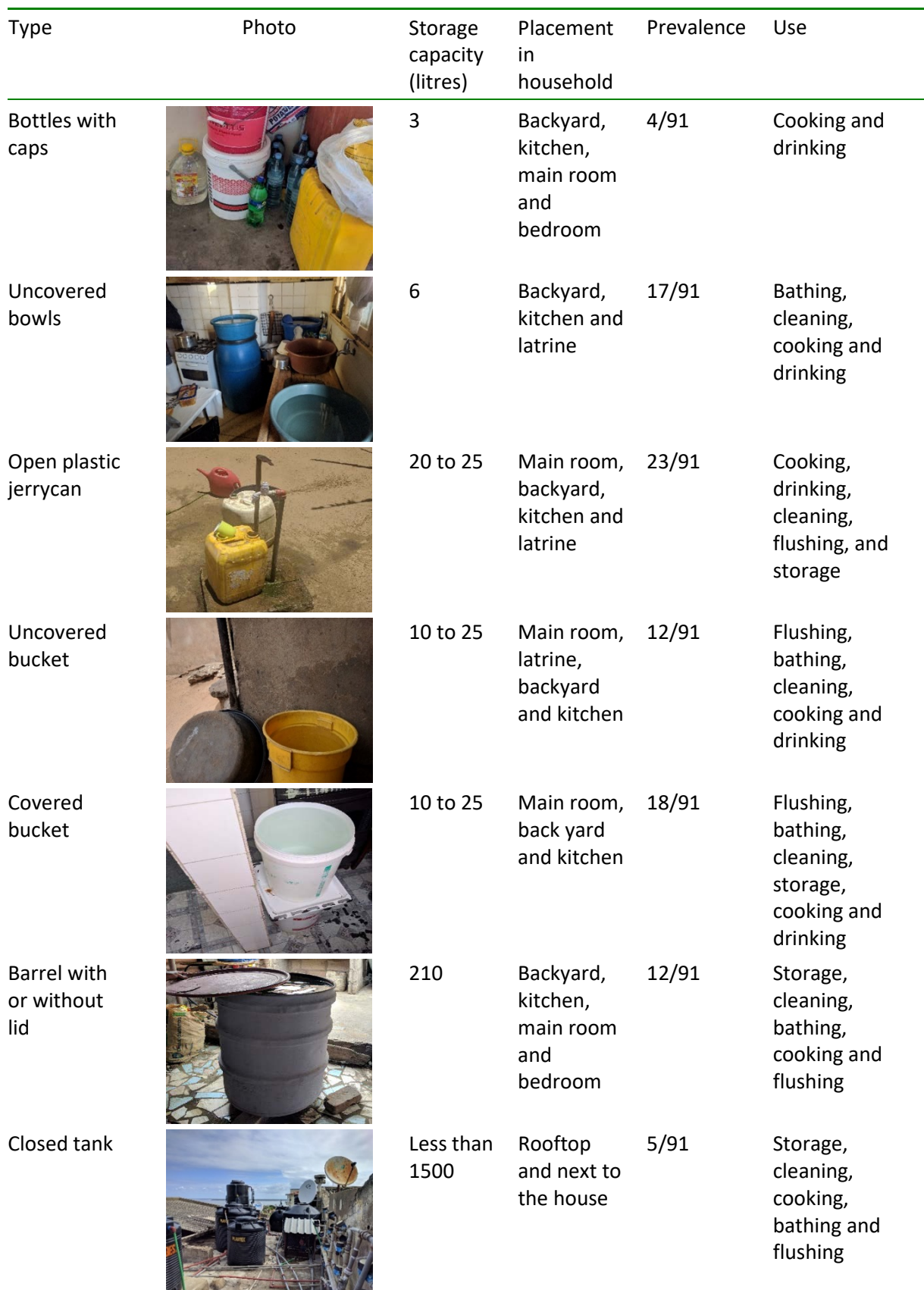
Table 1. Catalogue of water storage containers found in Maputo.