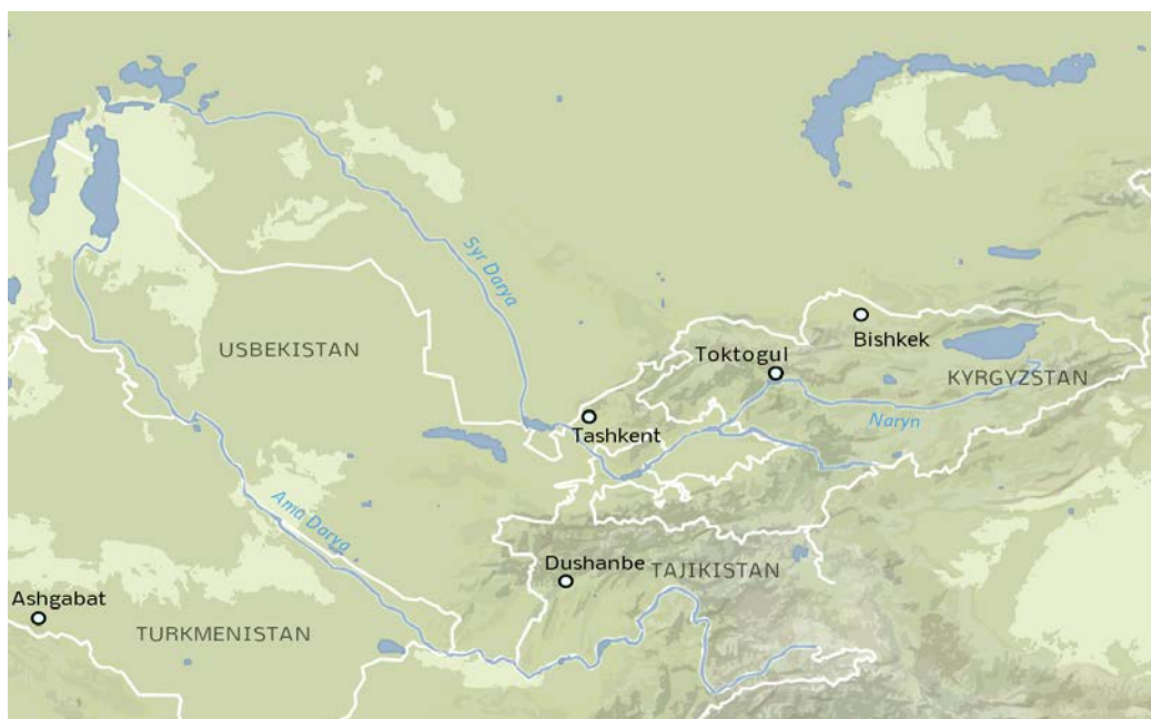
Figure 3. Map of the Naryn-Syr Darya.