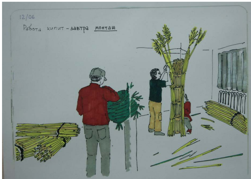
Figure 5. Building the reed Baiterek: drawing by Deniz Nazarova, installation by Zulya Esentaeva, Dinara Kanybek kyzy, Narynbek Kazybekov, Aibek Samakov. 2019.