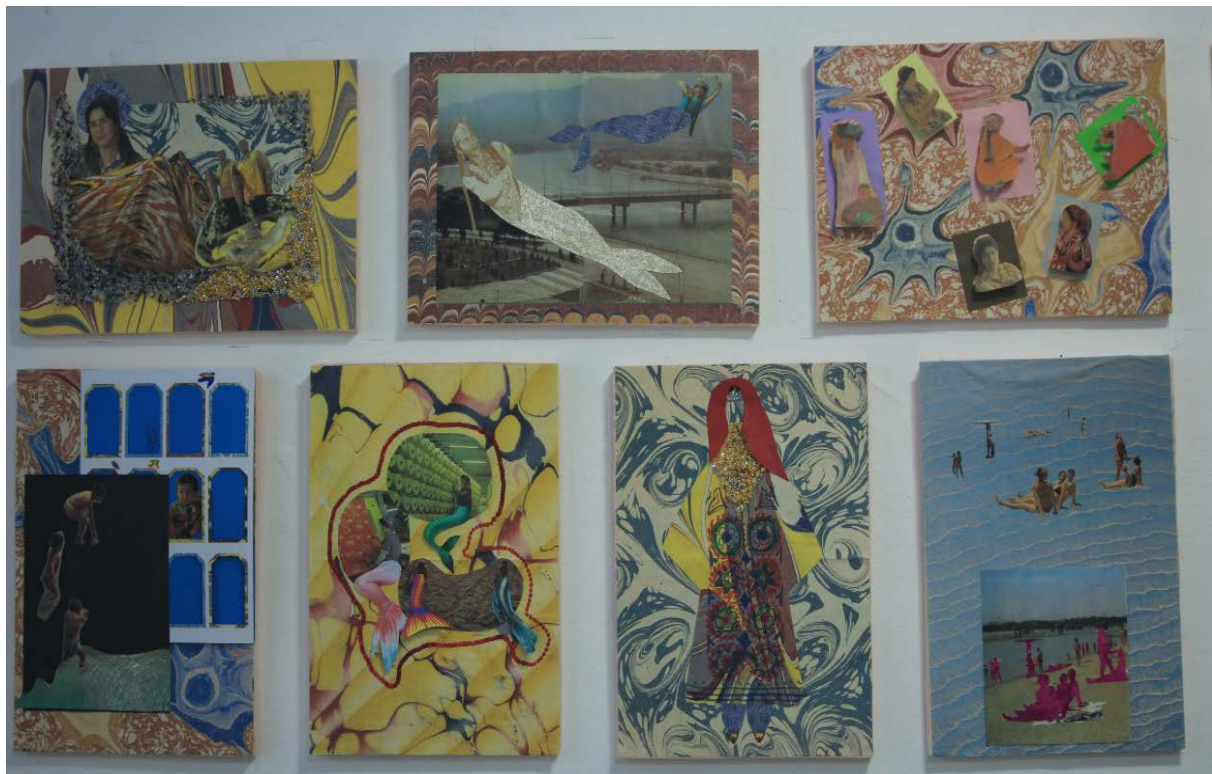
Figure 5. Collage series: Access Denied .

Source: Nazik Abylgazieva, Zulya Esentaeva, Altyn Kapalova, Oksana Kapishnikova, Aidai Maksatbekova, Olcha Shchetinina, Lia Sozashvili, Mokhira Suyarkulova (2019); photo by Oksana Kapishnikova 2019.