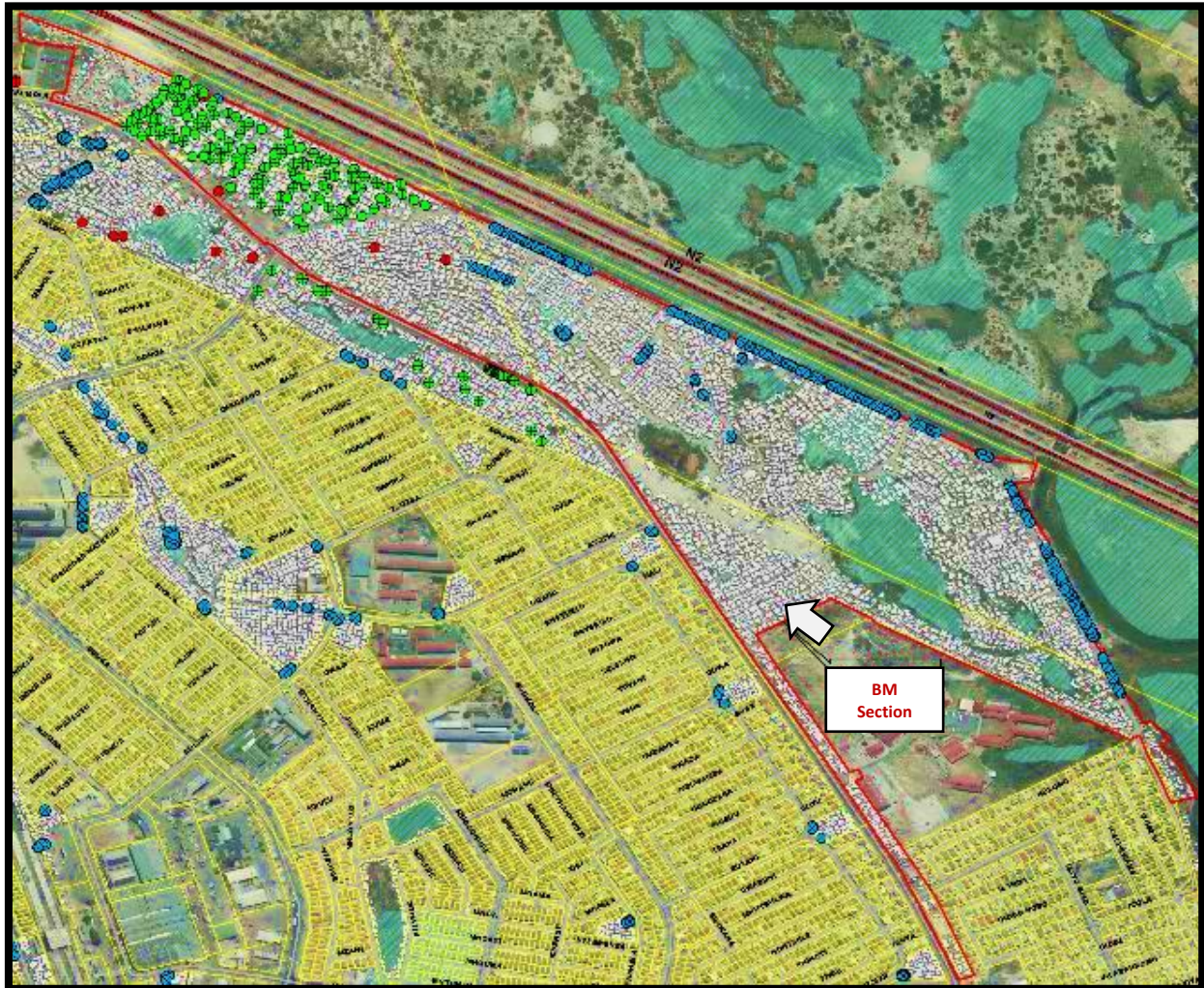
Figure 1. Map of BM Section (inside the red border) showing the density and location of full flush toilets (blue), container toilets (green), and chemical toilets (red).