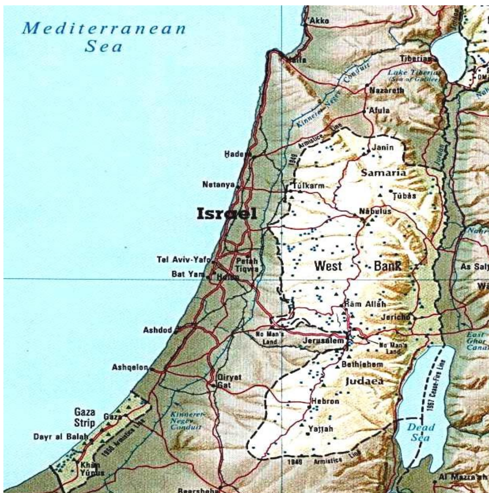
Figure 1. Palestine territories and Israel (CIA, 1993).

Early settlements utilised the Coastal Aquifer as part of citrus and other agricultural as well as urban development schemes. With the exhausting of the Coastal Aquifer (after the formation of the State), Israel turned to tapping the sea of Galilee, to provide needed water for development. There is significant conflict now over who has rights to exploit the aquifers that are recharged on the West Bank, as is seen in figure 2.