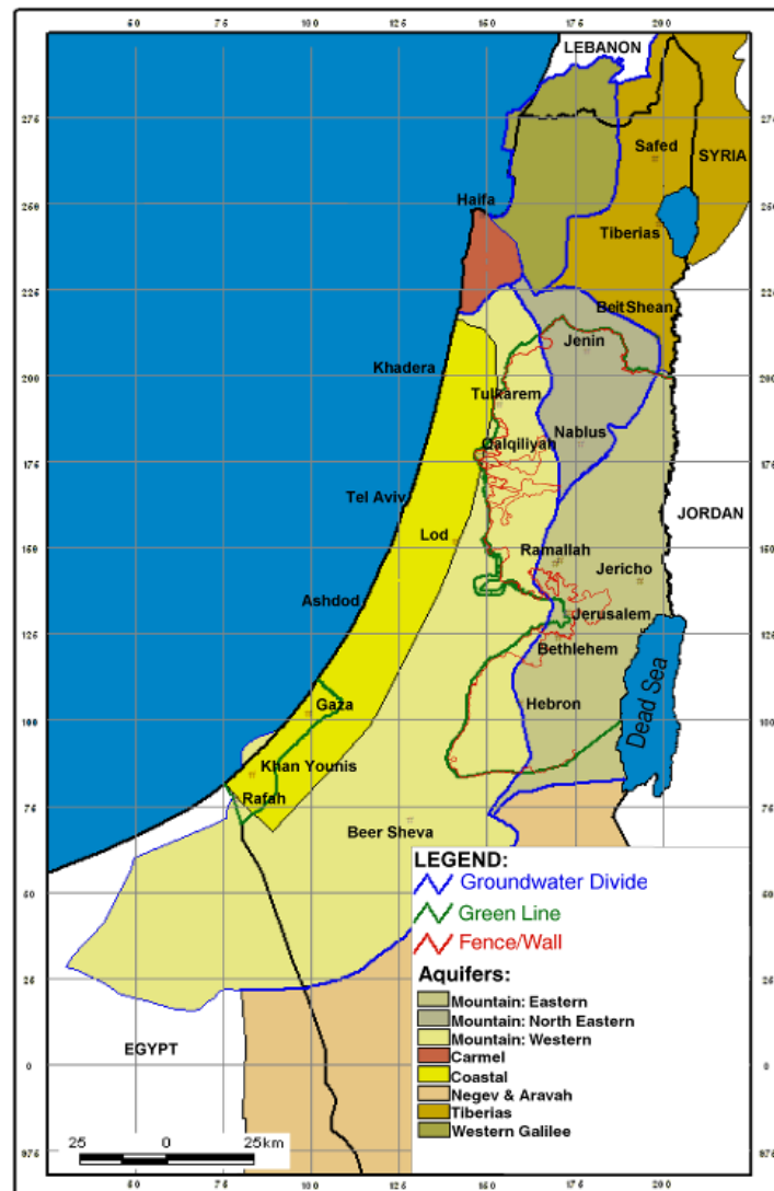
Figure 1. Transboundary Israeli-Palestinian water resources.