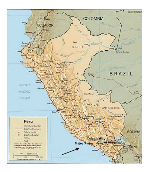
Figure 1. Map of Peru and the sites of field study.

discusses the political predicaments and social challenges the search for water alternatives in the Peruvian Andes implies (Figure 1). Its aim is to investigate an inherent tension in the water crisis in Peru and many other countries: the interests of some states and the agricultural, mining and other industries to commercialise water against the need for rural and urban populations to access clean and sufficient water for domestic and communal use. The seemingly incommensurability of the two demands reveals not only the political difficulties policy makers and governments face when they legislate water rights and tailor institutional settings for water management, but also the conceptual problems scholars encounter when trying to define the social and political nature of water and explain its opposing meaning as a commercial product and a public good, or as Bakker puts it: commons versus commodity (Bakker, 2007).